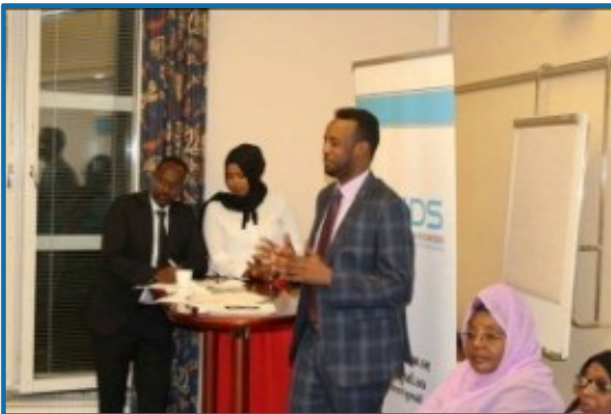
Former GSD Executive on the podium at the podium during the launch of the GSD chapter in Stockholm, Sweden.