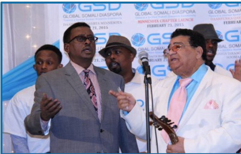
Launch of USA chapter of GSD in Minneapolis, Minnesota.