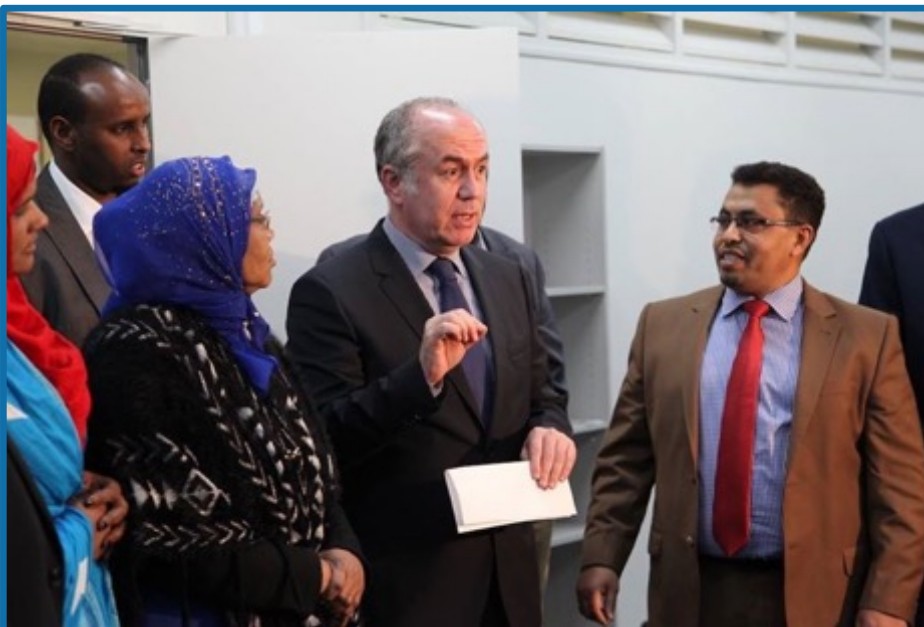
GSD with the Somali community in Australia, supporting Turkey Coup victims