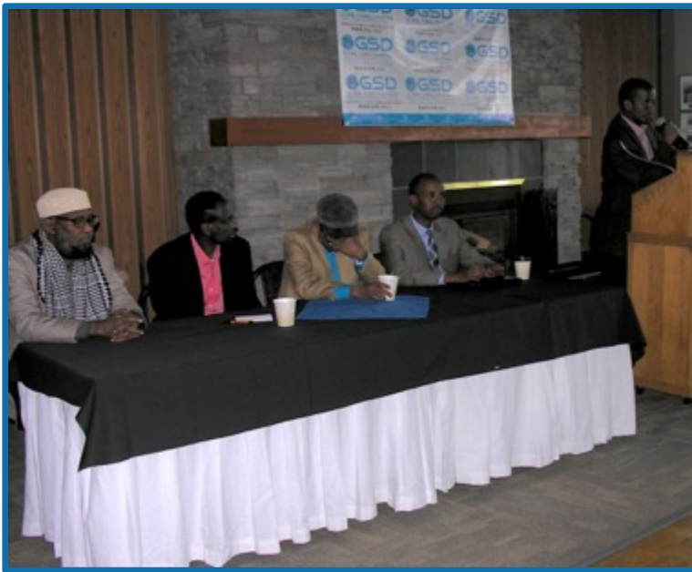
Launch of the Canadian chapter of GSD in Edmonton, Alberta, Canada.